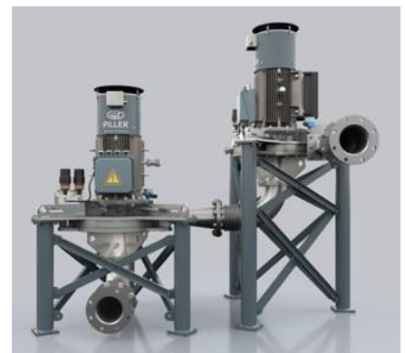
VapoFan 2-stage design