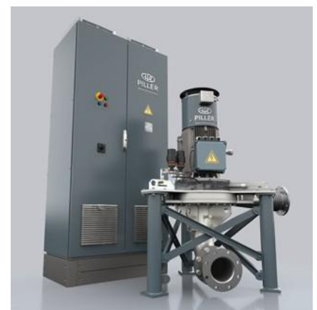
VFD Cabinet for High-Speed Motors